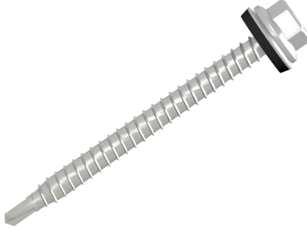
Self-drilling Universal Screw, Buildex 14-11 x 70 Hex Head Zips Climaseal 3 with 16 mm ABW Part No.: US-6.3/70-BW/BX